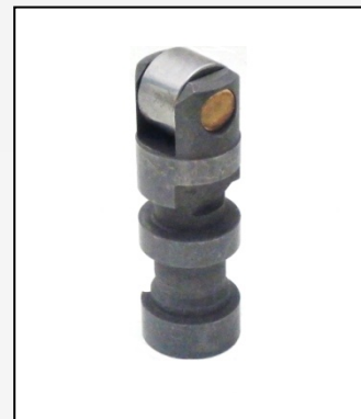
M-4535998 - Assembly – Valve Lifter

Contact Interstate-McBee for exact applications.