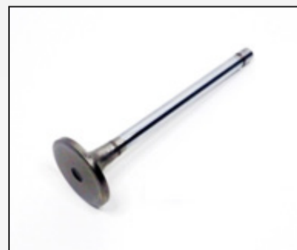
M-3394112 - Valve - Exhaust

Interstate-McBee continues to expand our industry leading heavy duty natural gas engine parts coverage with the addition of the M-3394112 Exhaust Valve for Cummins® GT14 engine applications. Manufactured from high temperature alloys with Stellite hard facing for superior wear and corrosion resistance, these valves are engineered to withstand the harsh environments of spark ignition application. When combined with our other GT14 valve train components, these valves aid in your cylinder head rebuild needs.