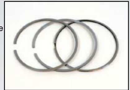
A-23537529 – Piston Ring Set

Contact our parts professionals for exact applications.