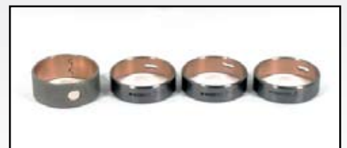
M-1875869C92 – Kit – Camshaft Bushing

Interstate-McBee is now stocking Camshaft Bushing Kits part number M-1875869C92 for Navistar® DT466E and DT570E four valve engine applications. This new kit contains all four bushings which are identification marked for proper positioning in the engine block and ease of installation.