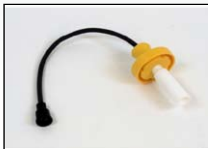
M-7W2479 Wire Assy – Spark Plug

Interstate-McBee is now stocking M-7W2479 Spark Plug Wire Assembly for G3304 and G3306 applications. High temperature rated materials are used in the critical areas to ensure long service life.