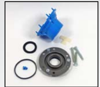
M-3804705 – Kit – Accessory Drive Seal