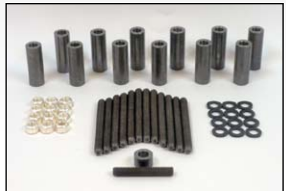
MCBC16ESK – Kit – Exhaust Stud C16

Contact an Interstate-McBee representative for further details.