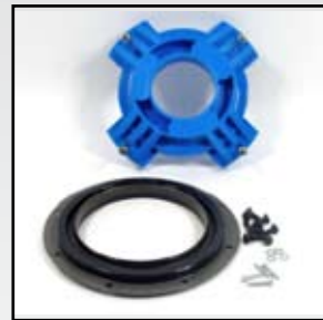
M-4089902 – Kit – Rear Crankshaft Seal