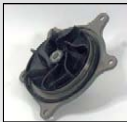
M-1889116C92 – Water Pump Kit

This newest Water Pump Kit for the 2010 engines is now in stock and available at Interstate-McBee. Since M-1889116C92 is a quality new water pump, it eliminates the cumbersome core charge and return process while offering a competitive cost.