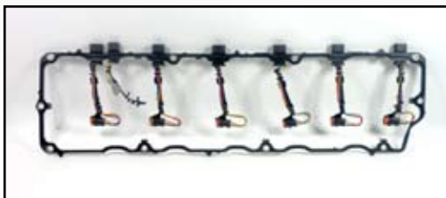
M-1842380C95 - Gasket & Harness Assembly

Also now available for this generation is the M-1842380C95 valve cover isolator seal and integrated injection wiring harness. This all in one design simplifies installation and helps to keep the injector wires organized for easy problem identification.