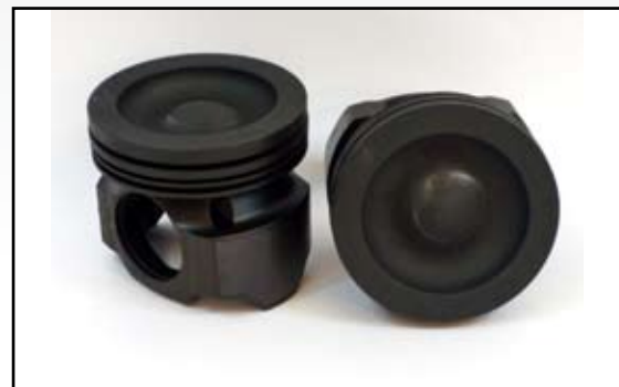
MCB3569946 – Piston C15 High HP

All original names, numbers, symbols and descriptions are used for reference purposes only and do not imply that any part listed is the product of this manufacturer.