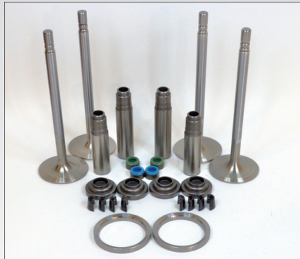
M-G-936-1044 Valve Kit

The new M-G-936-1044 kit shown here contains the intake and exhaust valves, intake and exhaust guides with seals, valve rotators, valve locks and standard intake seat inserts. Special volume discounts are available so contact your Interstate-McBee representative today for details.