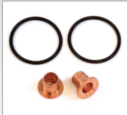
MCBISXINJ-2 External Seal Kit

Interstate-McBee fuel system innovation continues with this convenient seal kit for the current ISX common rail fuel injection models.