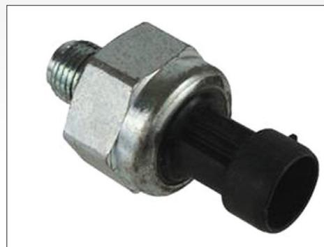
M-1830669C92 Sensor - ICP

NEW – Sensor - ICP part number M-1830669C92. This Injection Control Pressure sensor is common to DT466E and DT444 (7.3L) engine applications. Contact Interstate-McBee for details.